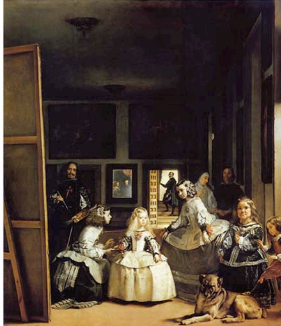
Diego Velasquez, Las Meninas , ca. 1656, Oil on canvas, 125 1/4 x 108 3/4 inches