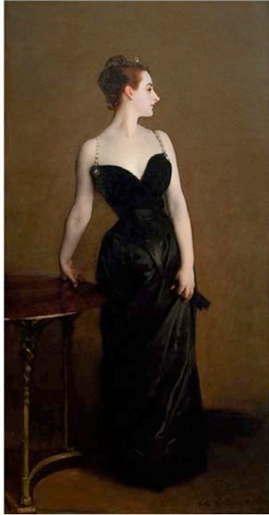
John Singer Sargent, Madame X 1883-84, Oil on Canvas, 82 1/8 x 43 1/4 inches