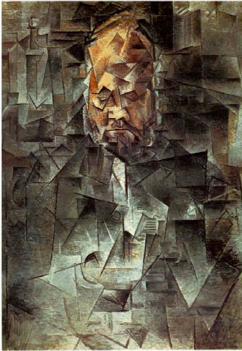
Pablo Picasso, Portrait of Ambroise Vollard , 1910, Oil on Canvas, 36 1/4 x 25 5/8 inches