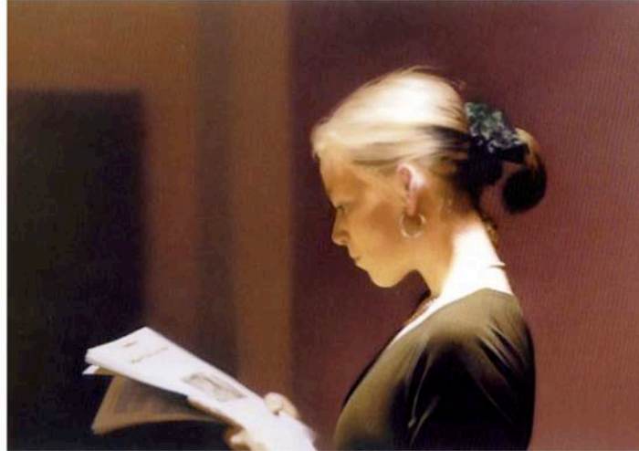
Gehrhard Richter, Lisende (Reading) , 1994, Oil on Linen, 28 1/2 x 40 1/8 inches