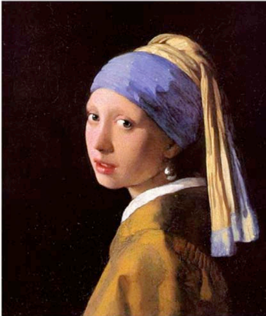
Johannes Vermeer, Girl with a Pearl Earring ca.1665, Oil on canvas, 17 1/2 x 15 1/4 inches