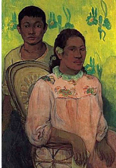
Paul Gauguin, Tahitian Woman and Boy , 1899, Oil on canvas, 37 1/4 x 24 3/8 inches

address more conceptually abstract issues, particularly the “tension” “between stillness and motion, time arrested and time passing.” 12